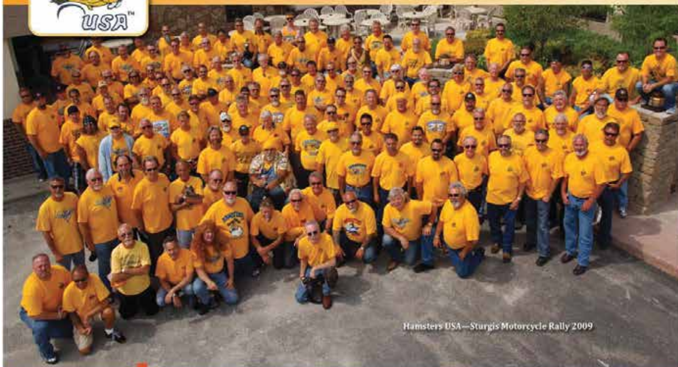
Hamsters USA—Sturgis Motorcycle Rally 2009

If the heart of custom motorcycling can be understood or experienced anywhere, it is most likely within the Hamsters USA organization. This is a group that is bound together by the love of custom bikes and the desire to spend quality time and develop lifelong friendships with like-minded people. These are men that work hard and play well. They are clearly the most distinguished group of custom motorcycle enthusiasts in the world.