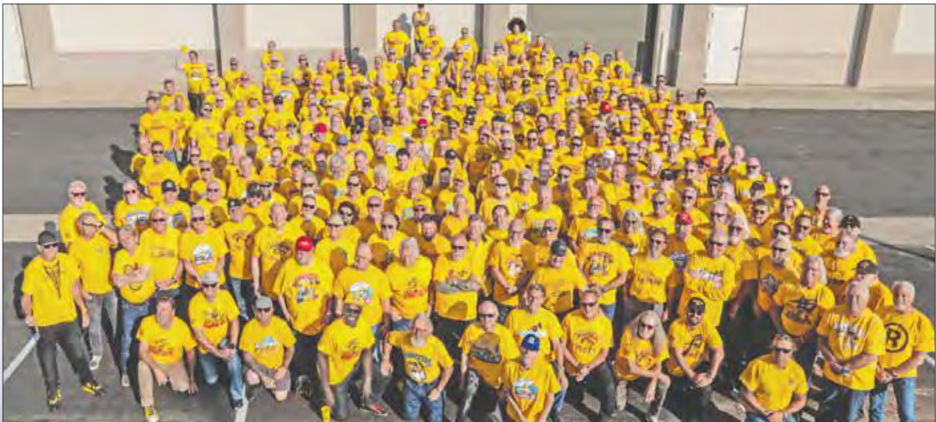
Members of Hamsters USA pose for a group photo at their 2024 annual banquet in Spearfish. For 20 years members of Hamsters USA have been giving to the Lifescope Foundation, to support various therapies for children in the Black Hills.

In addition to Lifescope, Hamsters USA also support Meals on Wheels in Spearfish, and the Sturgis Motorcycle Museum.