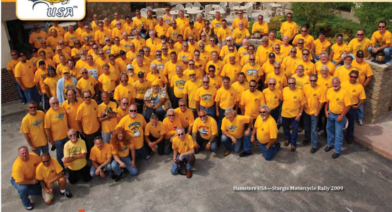
Hamsters USA—Sturgis Motorcycle Rally 2009

If the heart of custom motorcycling can be understood or experienced anywhere, it is most likely within the Hamsters USA organization. This is a group that is bound together by the love of custom bikes and the desire to spend quality time and develop lifelong friendships with like-minded people. These are men that work hard and play well. They are clearly the most distinguished group of custom motorcycle enthusiasts in the world.