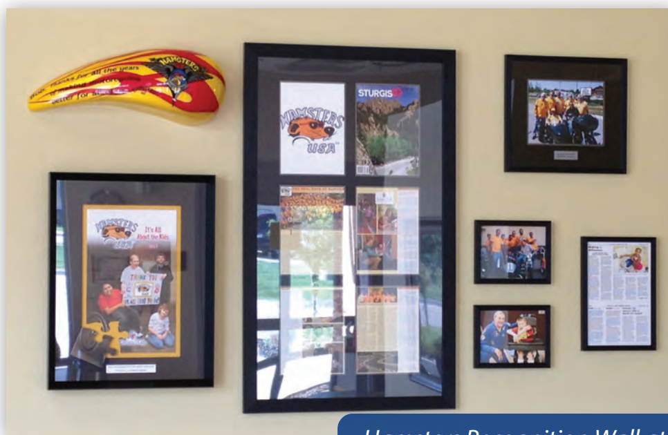
Hamsters Recognition Wall at LifeScape Children's Care Services in Rapid City

Hamsters USA has raised and donated funds at their annual meeting for the last ten years, wanting to give back to the greater Black Hills community, where they love to attend the annual Sturgis Rally. Their commitment to children with special needs has ensured that thousands of children over the years have received vital services. We thank Hamsters USA for making life better for kids in Western South Dakota!